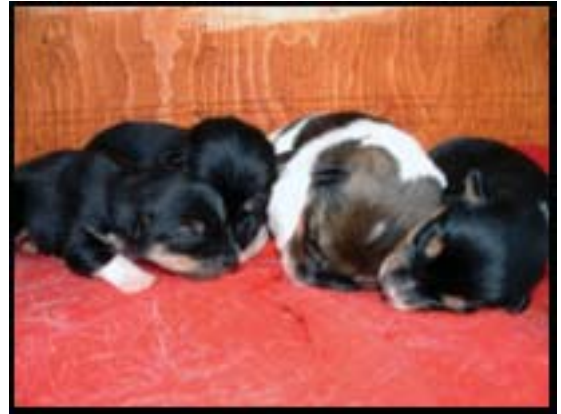
Tinkle's latest. We're onto the letter K for names. Anyone have suggestions?

Cheenik, in the center, knows what stopping is for, while Icarus and Iowa get a little extra attention for doing such a great job leading.