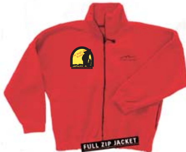
The Wolf's Den Fleece Jacket by Northern Outfitters

High quality, 13.5 oz. fleece. Full-zip, two side pockets, elastic cuffs, drawstring waist.