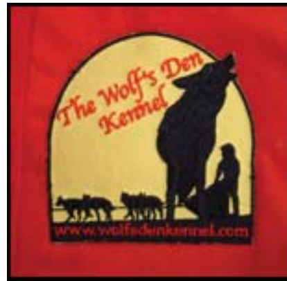
The Wolf's Den Patch $10.00