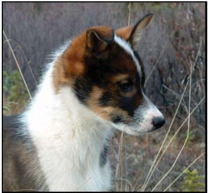
Above: Joker trying to determine if what's got his attention is edible or not. A puppy's curiosity never ceases to amaze me.